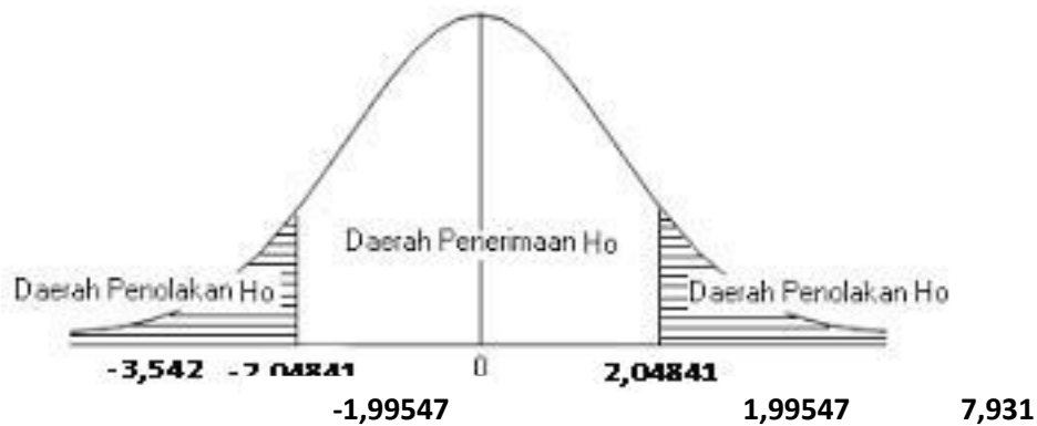
Figure 1. Hypothesis 1