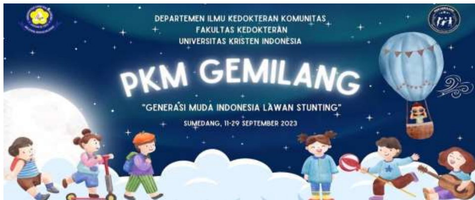
Figure 1. PkM Gemilang Activity Banners in 7 Villages in Rancakalong District, Sumedang Regency

Health service activities to the community as one of the real forms of academic involvement in solving community problems, especially regarding stunting which is still a major problem in Indonesia. Stunting is short or very short stature based on length/height according to age which is less than -2 Standard Deviations (SD) on the WHO growth curve, caused by chronic malnutrition related to low socioeconomic status, poor nutritional intake and maternal health, history of repeated illness and inappropriate feeding practices for infants and children. Stunting causes obstacles in achieving the physical and cognitive potential of children. The growth curve used to diagnose stunting is the WHO child growth standard curve in 2006 which is the gold standard for optimal growth of a child. This public health service activity, in general, was carried out very well thanks to the support of various parties starting from the Indonesian Christian University, specifically the Faculty of Medicine, to the local government in Rancakalong District, Sumedang Regency, West Java.