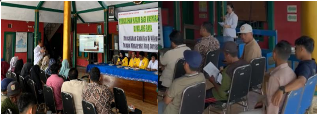
Figure 7. Inheritance Dispute Mediation Simulation in Srigonco Village

The legal counseling activity was then followed by an interactive dialogue forum. Representatives from the Master of Law Study Program Team, Postgraduate Program, Wisnuwardhana University, facilitated the Q&A session. Villagers raised questions regarding customary inheritance practices in Srigonco, the distribution of inheritance for land passed down through generations, and how formal law can be aligned with customary values. The youth highlighted the importance of understanding inheritance from the younger generation so that conflict can be prevented, while PKK group cadres raised the women's side, the role of female heirs, protection of inheritance rights for widows or daughters, and how mediation can accommodate gender bias. Following the dialogue, a mini-mediation simulation was conducted. Participants were divided into small groups, including community leaders, youth, and PKK cadres, and asked to map out a scenario for an inheritance dispute in the village. The mediators from the Master of Law Study Program team, Wisnuwardhana University and Bhirawa Satya Yustisi guided each group in preparing mediation steps, starting from preparing invitations to heirs, gathering facts such as inheritance documents, the wishes of the heirs, deliberation, formulating distribution options, to finalizing the agreement. This simulation puts into practice the mechanisms previously outlined in theory. Participants are seen simulating mediation of an inheritance dispute.