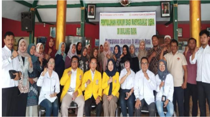
Figure 8. Joint Commitment of the Village Government, Srigonco Village Residents, and the MIH Unidha Study Program and LBH Bhirawa Satya Yustisi

Overall, the legal counseling activities not only provide legal understanding, but also strengthen the local culture of deliberation in Srigonco Village, strengthening synergy between educational institutions, advocacy, village officials, community leaders, youth and women. In this way, it is hoped that potential inheritance disputes can be managed as early as possible through mediation channels that are friendlier, cheaper, and more socially justified.