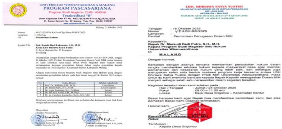
Figure 2. Letter of Request for Legal Counseling in Srignonco Village

Legal counseling related to the resolution of inheritance disputes is very necessary in Srignonco Village as a preventive measure, so that the community understands the rights and obligations as heirs, the mechanism for peaceful dispute resolution through mediation, and the importance of formal documentation so that conflicts do not escalate and family relationships are maintained. Legal counseling for resolving inheritance disputes also involves village heads so that in carrying out their duties they can resolve village community disputes peacefully in accordance with the mandate of the Village Law. Without educational steps like this, the potential for horizontal conflict between family members will remain high, which could ultimately damage social order and peace within society (Kudu, et al. , 2025), especially the people of Srignonco Village.