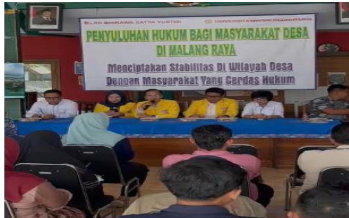
Figure 5. Presentation by the Master of Law Study Program Team, Wisnuwardhana University

The second session was delivered by a representative from Bhirawa Satya Yustisi Malang who discussed how mediation is carried out practically, selecting a neutral mediator, the stages of collecting facts and inheritance documents, inviting all heirs, initial deliberations, formulating agreements, and establishing a peace deed or agreement letter which can then be registered or ratified to have legal standing. The emphasis is given that if mediation is successful, family relationships can be maintained, costs and time can be reduced compared to court, and vice versa. As seen at figure 6, representatives from LBH Bhirawa Satya Yustisi Malang are providing an explanation of the material on resolving inheritance disputes to the participants.