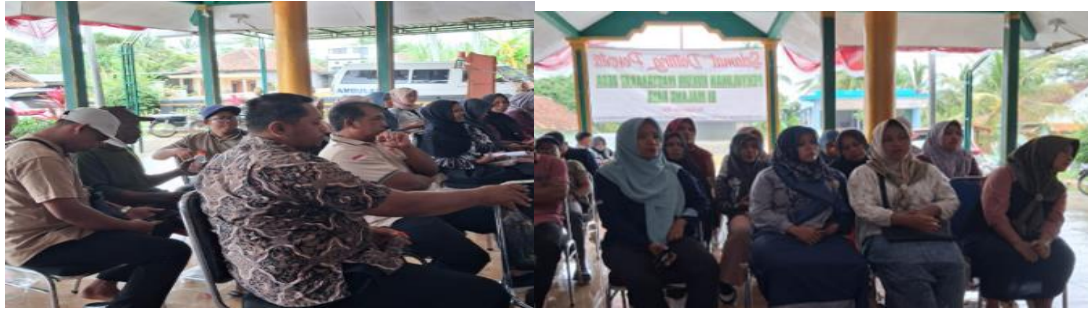
Figure 3. The People of Srigonco Village Enthusiastically Participated in Legal Counseling

The legal counseling event began with a speech from the Village Head, who explained the importance of knowledge about the law because every action must be based on the law. In the context of inheritance disputes that sometimes arise in the Srigonco Village community, they should be resolved using family customs or deliberation. This is based on the understanding that Srigonco Village itself is known as a village that prioritizes local deliberation as a way to solve social problems. Figure 4 below shows the Head of Srigonco Village giving a speech at a legal counseling event on resolving inheritance disputes.