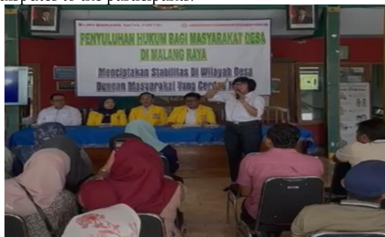
Figure 6. Explanation from the Representative of Bhirawa Satya Yustitisi Malang

The second session was delivered by a representative from Bhirawa Satya Yustisi Malang who discussed how mediation is carried out practically, selecting a neutral mediator, the stages of collecting facts and inheritance documents, inviting all heirs, initial deliberations, formulating agreements, and establishing a peace deed or agreement letter which can then be registered or ratified to have legal standing. The emphasis is given that if mediation is successful, family relationships can be maintained, costs and time can be reduced compared to court, and vice versa. As seen at figure 6, representatives from LBH Bhirawa Satya Yustisi Malang are providing an explanation of the material on resolving inheritance disputes to the participants.