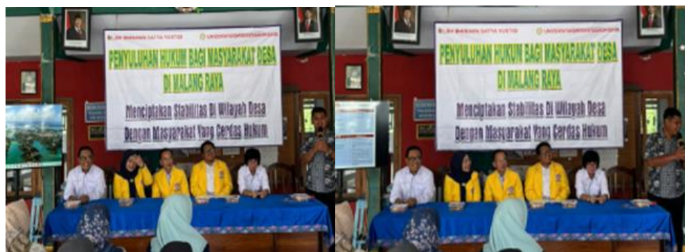
Figure 4. Greetings from the Head of Srigonco Village

The legal counseling event began with a speech from the Village Head, who explained the importance of knowledge about the law because every action must be based on the law. In the context of inheritance disputes that sometimes arise in the Srigonco Village community, they should be resolved using family customs or deliberation. This is based on the understanding that Srigonco Village itself is known as a village that prioritizes local deliberation as a way to solve social problems. Figure 4 below shows the Head of Srigonco Village giving a speech at a legal counseling event on resolving inheritance disputes.