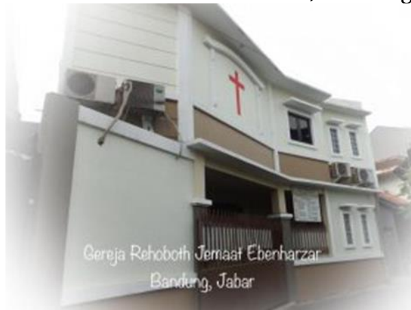
Figure 2. Location of Rehoboth Ebenhaezar Church Bandung