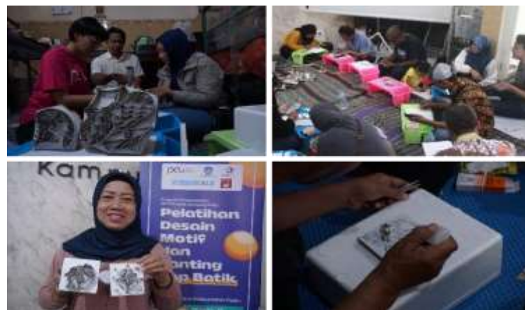
Figure 7. Training activities for making batik canting stamps

With the availability of affordable canting stamps, the increase in productivity of batik artisans in Dolly has become an important breakthrough in the batik craft industry sector. Previously, the participants could only complete one piece of cloth (measuring 115 x 200 cm) in one month using a traditional canting . This is due to the batik-making process, which requires high patience and a long time to draw each motif by hand. This process is undoubtedly very exhausting and affects the limited production capacity. However, using a canting stamps, the participants can now complete 15 pieces of cloth in one week. This means that in one day, they can produce 1 to 2 pieces of batik fabric. The increase in the amount of fabric that can be produced in a short time certainly significantly impacts the volume of batik production in Kampong Dolly.