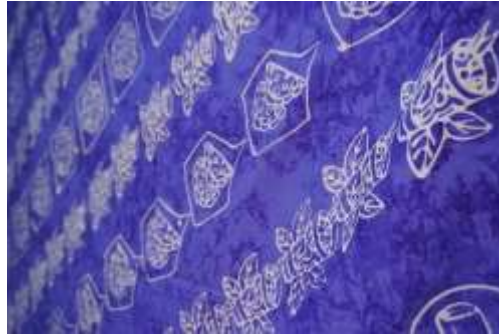
Figure 4. Batik Kocak Dolly (Author, 2025)