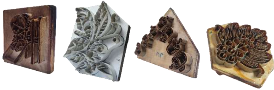
Picture 8. Batik Stamp Canting Successfully Made by Participants (Author, 2025)

Wood waste is utilized, and paper waste is obtained from leftover food packaging from various communal events in the village, such as snowmen, Italian, weddings, and similar activities. This paper waste, usually discarded, now has added value because it is used as the primary material for canting stamps. Thus, the participants successfully created simple yet practical technology that is environmentally friendly while also helping to reduce the amount of waste in their surroundings. Using these recycled materials not only benefits the artisans economically but also positively impacts the environment by reducing the amount of waste that needs to be disposed of.