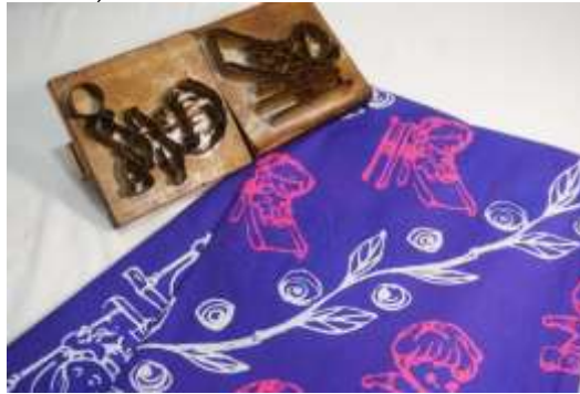
Figure 6. Batik Dollan (Author, 2025)

symbolizing that there is still hope for a brighter future for our children” (Silvia Ratnani, 2024).