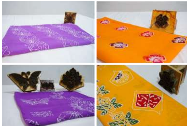
Figure 10. Results of the Batik Training Activities (Author, 2025)

Although this training is considered very beneficial, some participants provided suggestions for improvement in the future. Some participants suggested that future training should allocate more time for practical sessions, especially for the more challenging parts, such as color mixing and canting stamps making. Additionally, some hope that the training can focus more on developing creativity in motif design. These suggestions reflect the importance of developing more flexible design skills that can be applied to create more modern and innovative batik.