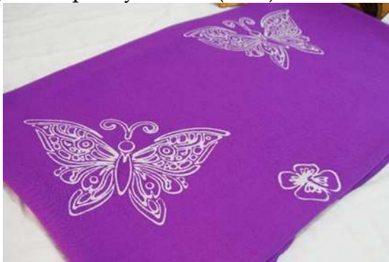
Figure 3. Batik Dollyptera (Author, 2025)

“That is right. The metamorphosis experienced by butterflies inspires me to depict the changes happening in Kampong Dolly. Like a caterpillar that initially has an ugly and simple form, then becomes a cocoon. Finally, a beautiful butterfly that can fly freely; the same goes for the people of Dolly. We are also transforming a better life. The Dollyptera Batik motif symbolizes the hope that women in Dolly, previously associated with negative social stigma, can now transform into individuals with a better and more dignified quality of life” (2024).