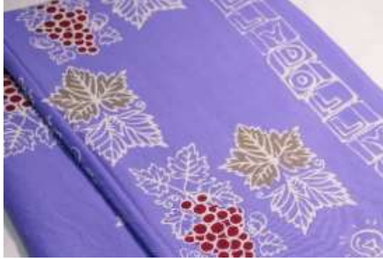
Figure 2. Batik Tandur Anggur (Author, 2025)

“I chose this grape because grapevines have a long but fascinating growth process. We start with cuttings, which gradually develop into plants with strong roots. Then, small leaf buds began to grow, developing more and more, producing branches and eventually many grapes like now. All these stages reflect the change this village experienced” (Joko Mariyanto, 2024).