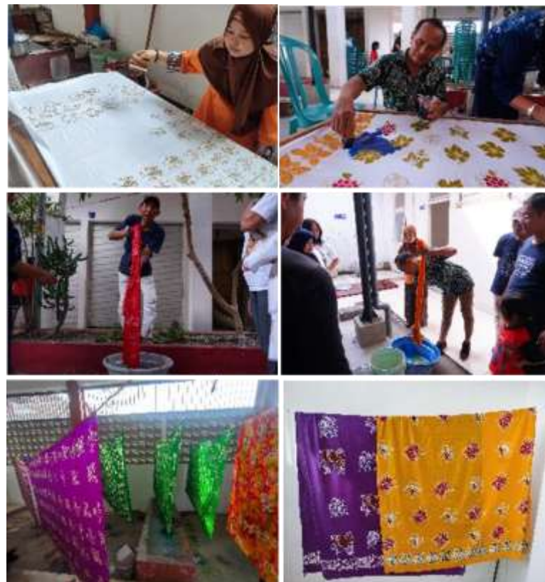
Figure 9. Batik Practice

The final stage is removing the wax by boiling it in hot water. The wax used to cover certain parts of the fabric during the dyeing process must be removed to see the desired batik pattern. The wax is removed by soaking/boiling the fabric in hot water. This process requires special skills, as participants must know the exact temperature and time to remove the wax without damaging the quality of the fabric or the batik pattern that has already formed. Moreover, ensure that all the wax has completely faded and is clean. By mastering this technique, participants can ensure that the batik products maintain high quality and clear motifs.