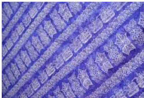
Figure 5. Batik Dolly-Diesel (Author, 2025)

“This Dolly-Diesel batik is inspired by the history of the Dolly village, which used to heavily rely on diesel engines as the main source of electricity.” In the past, almost every house used diesel engines to power the lights because no other sources of electricity were available. This diesel engine became a symbol of light and strength, providing illumination at night and offering hope to a community living in limitations. The motif in this Batik Dolly-Diesel depicts the resilience and fighting spirit of the Dolly community from the past to the present, which remains unchanged. Although facing limitations, they continue to strive to survive and find ways to live better. So, this batik reflects the characteristics of the people of Dolly who have a fighting spirit and do not easily give up” (Agus Setyo, 2024).