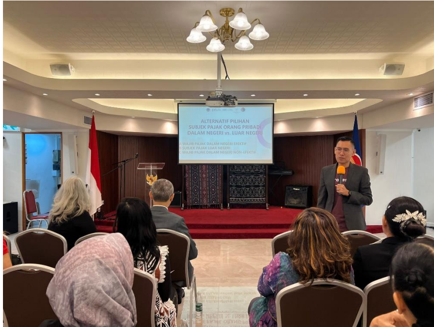
Figure 5. Seminar on Indonesian Citizens Subject to Tax Regulation

Figure 6 and Figure 7 below show the worksheets resulting from the simulation of calculating net assets and income tax payable by PMI.