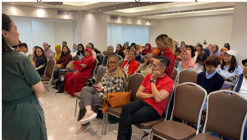
Figure 8. Discussion and Q&A Session

Based on the analysis of pretest and post-test data from workshop participants, it was found that the average pretest score was 2.38, while the average post-test score increased to 2.98. This represents an increase of 0.60 points, or approximately 25.21%, from the average pretest score to the post-test score. This indicates that the workshop had a positive impact on improving participants' understanding. Furthermore, of the 63 workshop participants, 31 experienced an increase in their scores, or 49.21%. These results indicate that nearly half of the participants experienced an increase in their understanding of tax and customs regulations after attending the workshop.