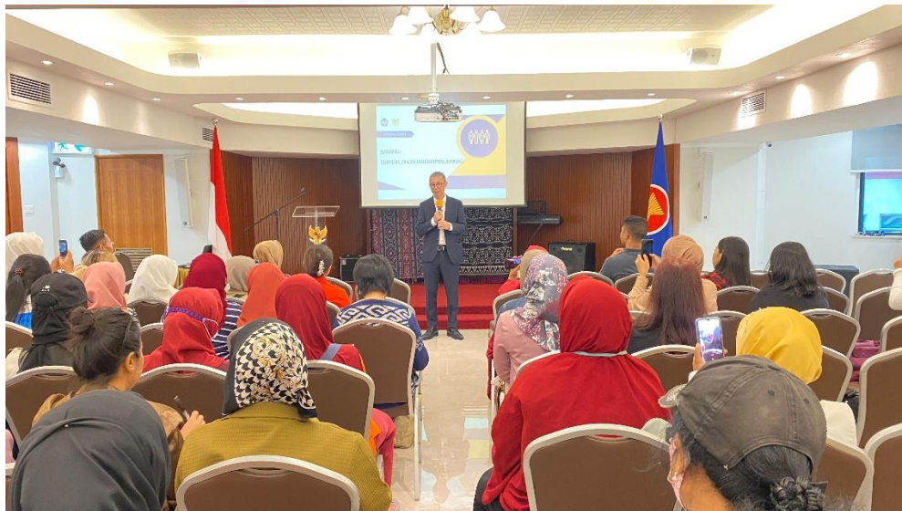
Figure 4. Seminar on Indonesian Citizens Subject to Customs Regulation