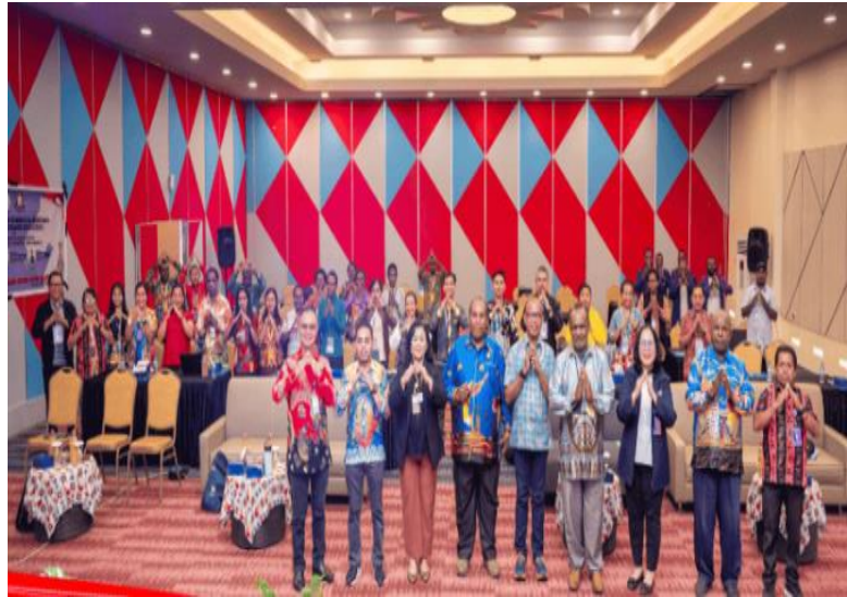
Figure 3. Day-1 Activities, March 27, 2025

The results of the counseling and training held on March 27-28, 2025, which were attended by 38 people, the participants were very happy to be able to take part in the training as shown by the participants being present for two days according to the schedule, none of them were late. Participants have 1-2 hours from their homes to the training location but remained enthusiastic and happy to participate in the activities. Participants gained knowledge about the concept and mechanism of developing the OBE Curriculum to support MBKM (OBE Curriculum Guide, 2024). Participants were accompanied by a facilitator to develop the OBE Curriculum.