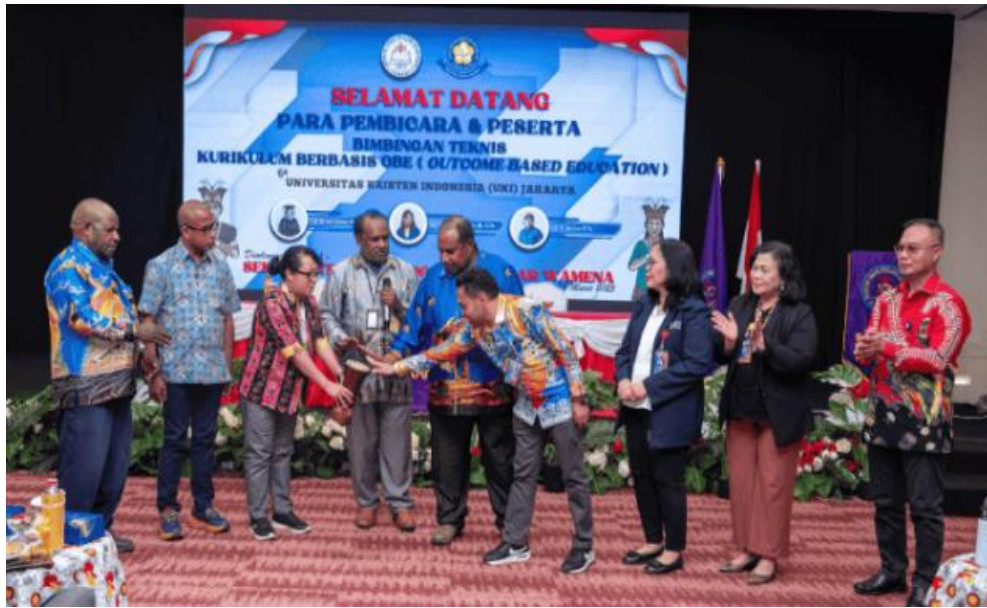
Figure 2. Opening Ceremony