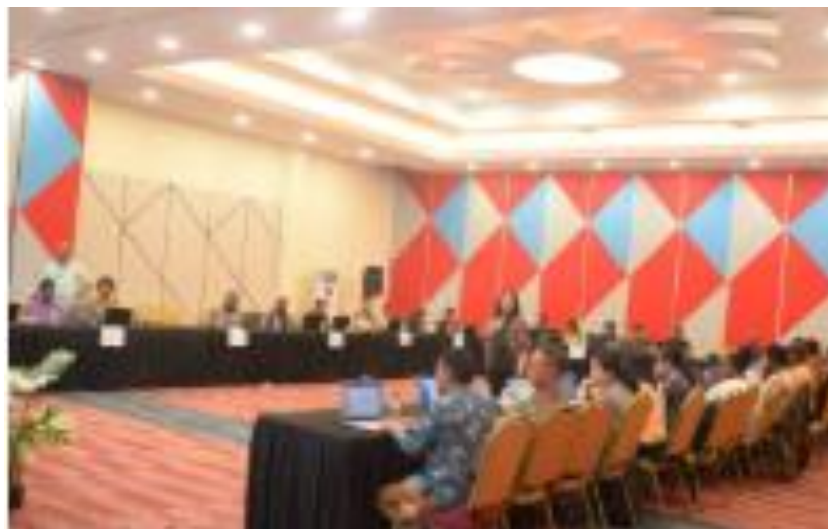
Figure 4. Day-2 Activities Training, March 28, 2025