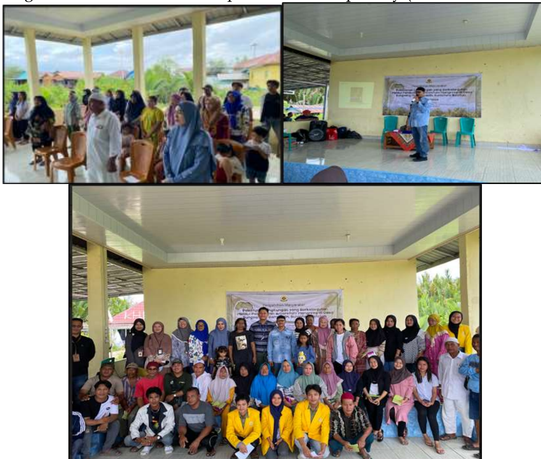
Figure 2. Community-Based Mangrove Ecotourism Outreach Activity Mangrove Arboretum in Sungsang Village IV

ecotourism management in Karangsang is highly suitable for educational and research tourism, with an ecotourism suitability index of 83.7%. Proper management can accommodate up to 803 visitors per day (Prihadi et al., 2024).