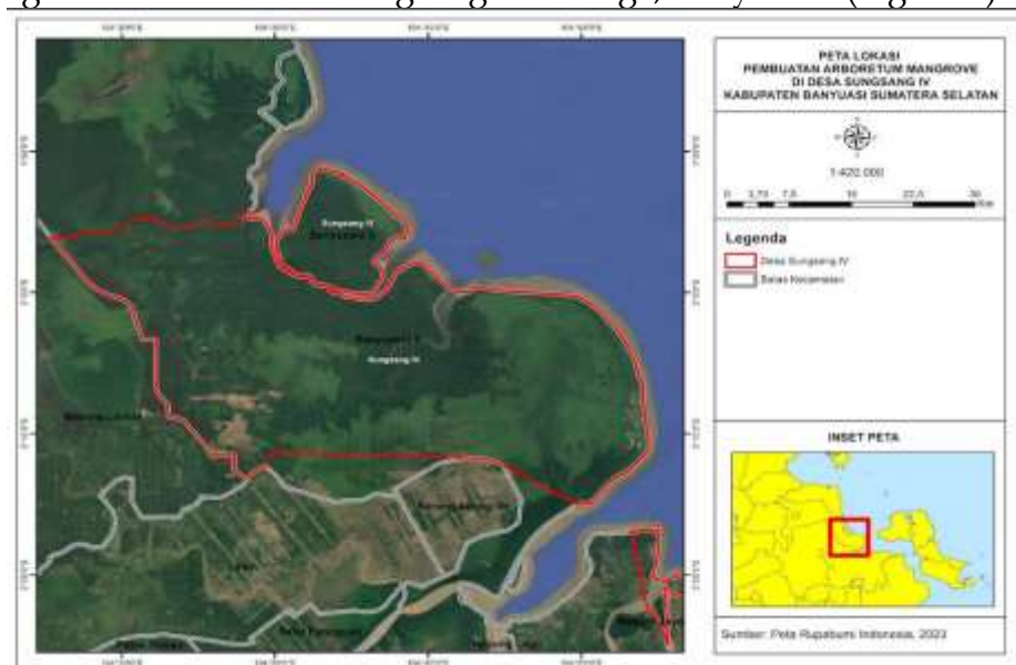
Figure 1. Location of the Mangrove Arboretum in Sungsang IV Village, Banyuasin

Banyuasin Sungsang IV Village is located on the coast of Banyuasin Regency, South Sumatra, and is known as a fishing village with a high dependence on the mangrove ecosystem and marine products such as fish, shrimp, crab, and shellfish. The community's primary source of income comes from capture fisheries and the use of mangrove forest products, including building materials and nipah palm products (Ahmad Panandi, Andy Mulyana, 2019). The economic value of mangrove ecosystem services in Sungsang IV reaches approximately IDR 1.7 billion per year, dominated by marine catches. In addition to fisheries, the community has also begun developing a mangrove-based creative economy, such as training in making beauty soap from mangrove extracts and processing organic waste into eco-enzymes and fertilizer. These training programs improve the community's skills and knowledge in sustainably utilizing local resources (Meidalima et al., 2023). The following is the location of the mangrove arboretum in Sungsang IV Village, Banyuasin (Figure 1).